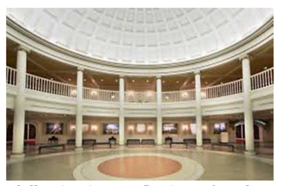
Thursday, October 6, 2016: Dessert Reception and IllumiNations: Reflections of Earth Fireworks Show (registration required)