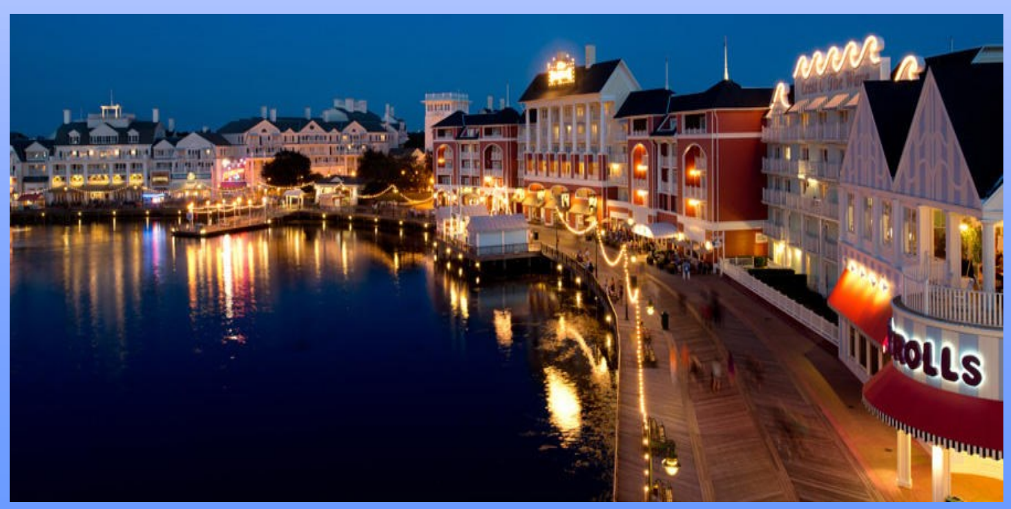
VISIT THE EVENT SITE AT http://www.mydisneymeetings.com/the-florida-bar16

FREE Wifi – LOG ONTO Public Space Guest WIFI NO PASSWORD NEEDED